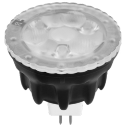
MR16-4W (Adjustable) MR16-7W (Adjustable)