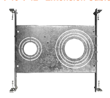
CUNV-NC-ICAT-7H Universal Pre-Mounting Plate 13 7/8" x 15 1/8"