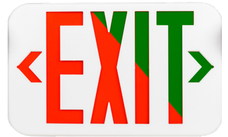
Single or Double Face (both plates included)