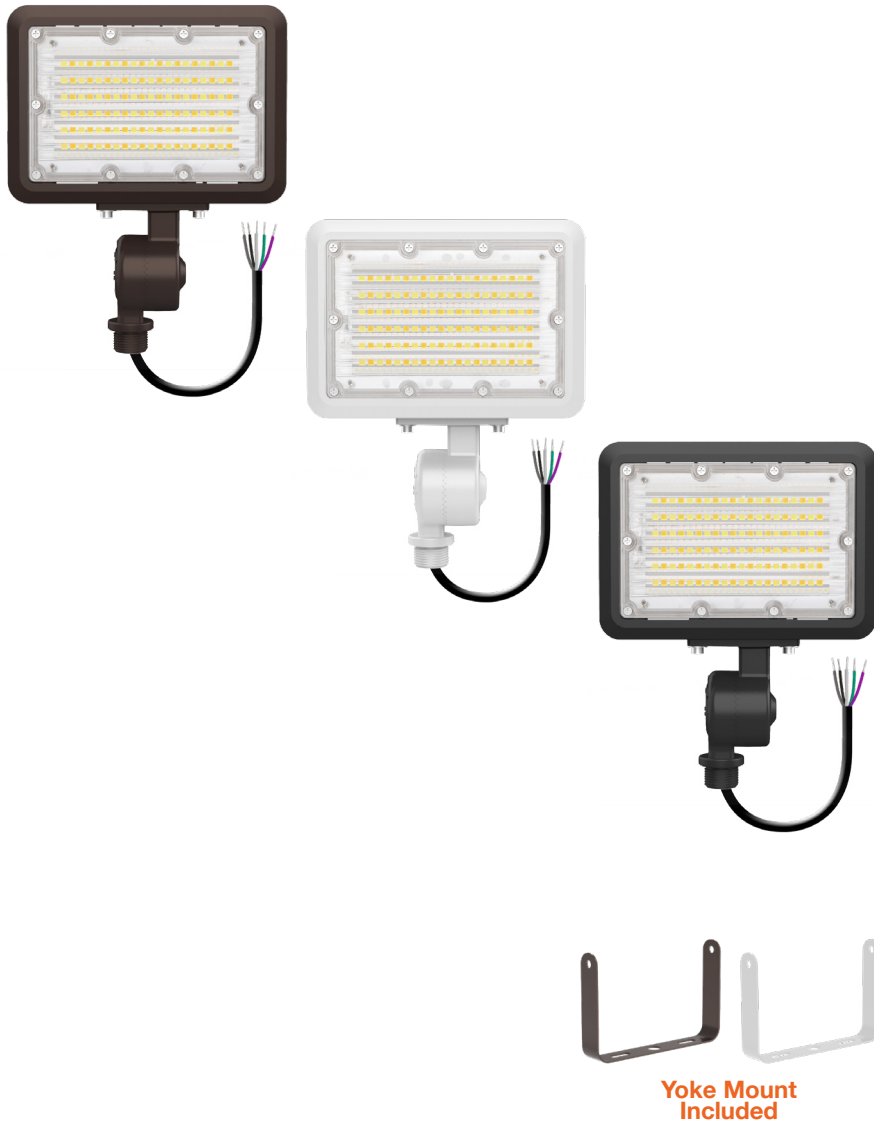
Yoke Mount Included