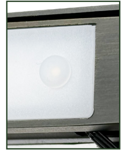
5-CCT Selectable Push Button