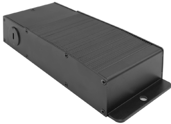
CV-12V-DC-20W-DIM CV-12V-DC-60W-DIM CV-12V-DC-150W-DIM