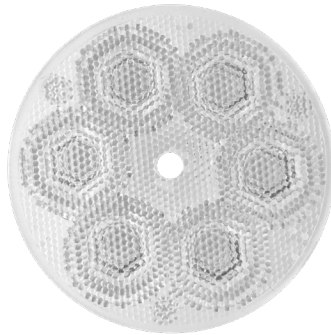
15° / 30° / 60° Replaceable Lens