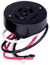
3 Pin Receptacle PC-TWL-RC