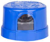
3 Pin Photocell 120-277V PC-TWL-UNV