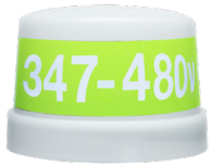
3 Pin Photocell 347-480V PC-TWL-HV