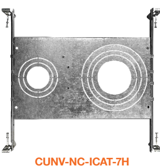
Universal Pre-Mounting Plate 13 7/8" x 15 1/8"