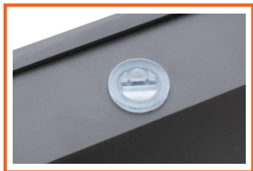
Optional Photocell Dusk to Dawn