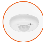
Shown with Sensor Option